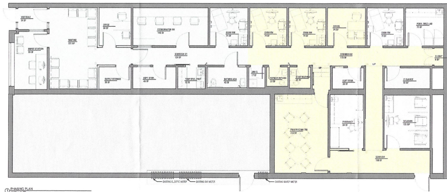
① PHASING PLAN 1/4" = 1'-0"

Project Team: OWNER NYU LANGONE HEALTH 540 First Avenue New York, NY 10016 ARCHITECT JACK L. GOODWIN ARCHITECTS, P.C. NA 340 Seventh Avenue New York, NY 10011 (212) 278-0560 MECHANICAL CONSULTANTS LONG CONSULTING ENGINEERS, INC. 380 West 11th Street New York, NY 10011-4217